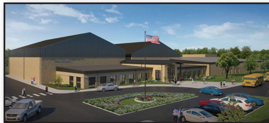
Proposed architectural drawing of the high school.